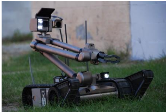
Fig. 2: iRobot Packbot [iRobot Corporation].

there are 10,000 such systems currently in use worldwide, in both military and civilian roles. These robots can drive around under remote control, often have an arm that can pick up and manipulate objects, and have a suite of sensors that relay data back to the operator. While they are completely controlled by a human operator, and currently have no autonomous capabilities, they often look intelligent to an external observer (who might be unaware that there is a human pulling the strings).