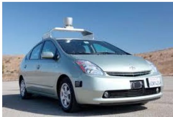
Fig. 6: A Google driverless car [Google].

These research robots are starting to make the transition into the real (or, at least, commercial) world. Google has a fleet of self-driving cars that have traveled more than 150,000 miles on the US road system without incident. (See Fig. 6). Robots used as therapeutic aids are available, and quickly becoming more widespread. 16 Robots are being evaluated as assistants in the homes of individuals with severe motor disabilities. 17 These trends will only accelerate in the coming years. More and more robots will enter our daily lives in the coming decade, and it is likely that many people will own a (useful) personal robot by 2022. This appearance of robots will drive a number of legislative challenges.