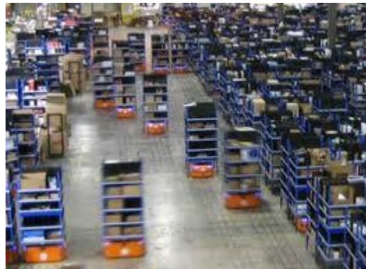
Fig. 4: The Kiva Automated warehouse system [Kiva Systems].

Finally, autonomous warehouse robots, designed by Kiva Systems, now help humans fulfill orders for several on-line retailers, including Zappos and Amazon.com (who recently acquired Kiva Systems for $775 million 12 ). These robots bring whole racks of merchandise to a human who selects the appropriate items for a given order, and puts them in a shipping box. The robots are centrally-coordinated by the inventory system, and operate autonomously. The robots have no on-board sensors, and rely on wires embedded in the factory floor to determine their location. However, they certainly seem to have their own mental agency as they avoid each other and reconfigure the storage locations of items in the warehouse based on customer demand. (See Fig. 4).