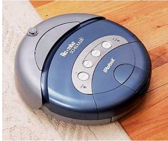
Fig. 1: iRobot Roomba [iRobot Corporation].

achievement than one might think, especially given these inexpensive robots are available to consumers for only a few hundred dollars, depending on model.