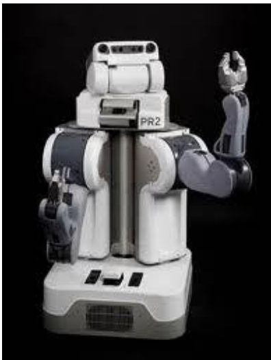
Fig. 5: The PR2 research robot [Willow Garage, Inc.].

While it is impossible for us to briefly survey all of the current research going on worldwide, we can highlight some common themes that seem to be emerging. First, many research robots are now multi-purpose, rather than being designed for a single task in the way that many of the systems above are. For example, the PR2 robot from Willow Garage 15 appears in many videos, performing a variety of tasks. (See Fig. 5). Second, robots are starting to interact with people who do not know anything about robots. They no longer need to be accompanied by a graduate student escort, who has traditionally acted as a minder, interpreter, mechanic, and bodyguard. People with no experience of robots are now encountering and collaborating with them directly. While this is necessary if we are to fulfil the long-term potential of the technology, it also complicates matters hugely. Humans are unpredictable, easy to damage, and hard to please; a lot of research is currently aimed at allowing robots to deal with them gracefully and safely. Third, they are becoming more and more autonomous, as we solve the underlying technical challenges of perception and reasoning. Finally, there is an increasing focus on robots that work in the real world, not just in the lab. This requires us to deal with all of the uncertainty and unpredictability inherent in world in which we live.