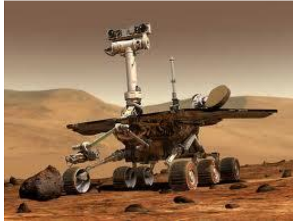
Fig. 3: A Mars Exploration Rover.

Finally, autonomous warehouse robots, designed by Kiva Systems, now help humans fulfill orders for several on-line retailers, including Zappos and Amazon.com (who recently acquired Kiva Systems for $775 million 12 ). These robots bring whole racks of merchandise to a human who selects the appropriate items for a given order, and puts them in a shipping box. The robots are centrally-coordinated by the inventory system, and operate autonomously. The robots have no on-board sensors, and rely on wires embedded in the factory floor to determine their location. However, they certainly seem to have their own mental agency as they avoid each other and reconfigure the storage locations of items in the warehouse based on customer demand. (See Fig. 4).